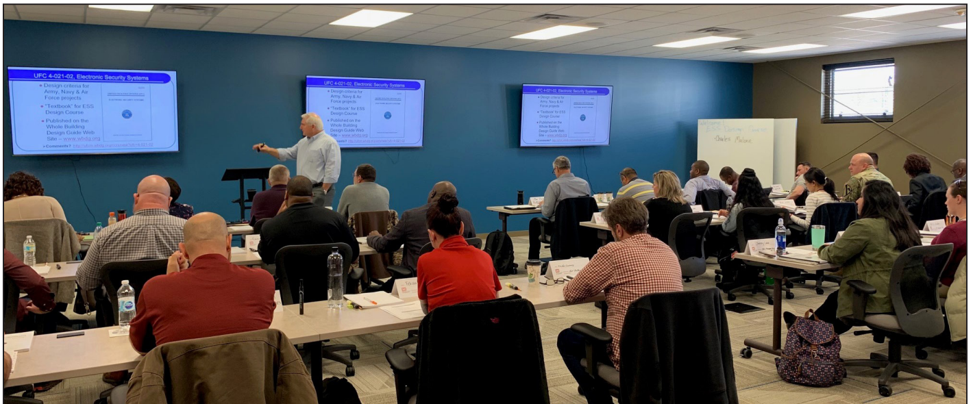
Pictured is the ESS Design Course in March 2019.

The ESS-MCX provides technical support services to the Army.